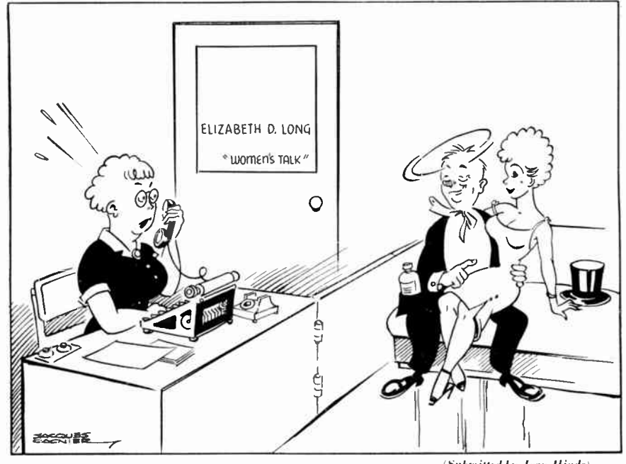
". . . He says he has some good ideas for 'Community Fun' . . . "