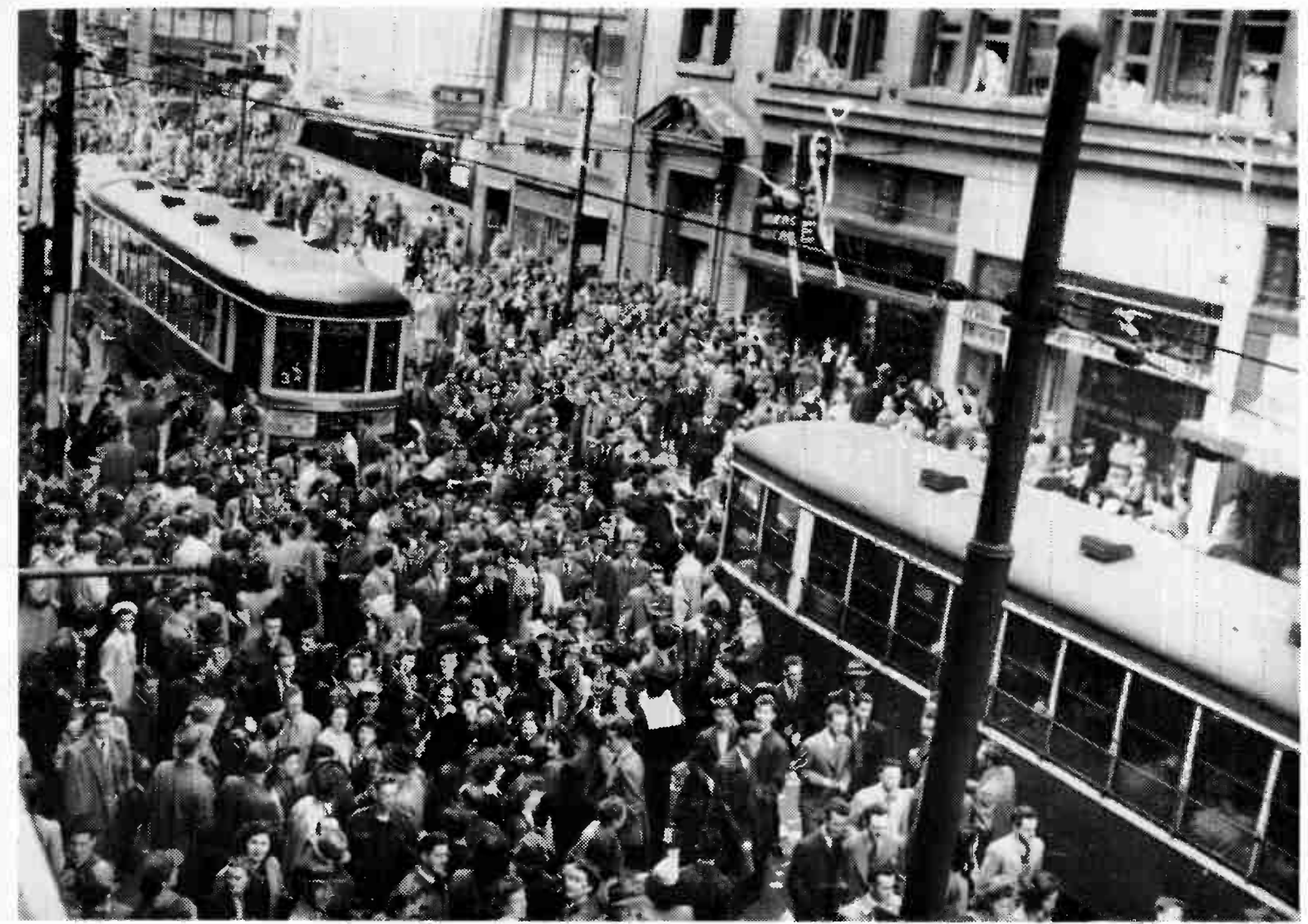
(News pictures from The Herale