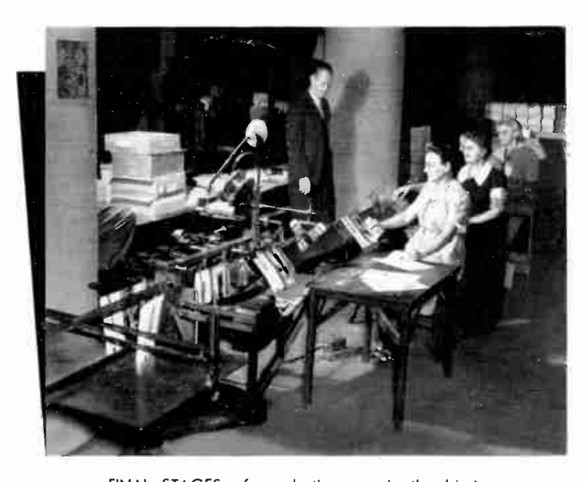
FINAL STAGES of production are in the bindery. Plant Superintendent inspects magazines being fed to "Rossback Stitcher Feeder" for automatic stitching. RADIO is then ready for mailing and distribution to staff.