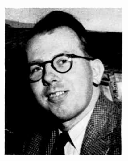
Of Some Importance . . .

Doesn't the CBC Bechive pick the honey of entertainment? Well, you can't help hearing it buzzing night and day and like it!