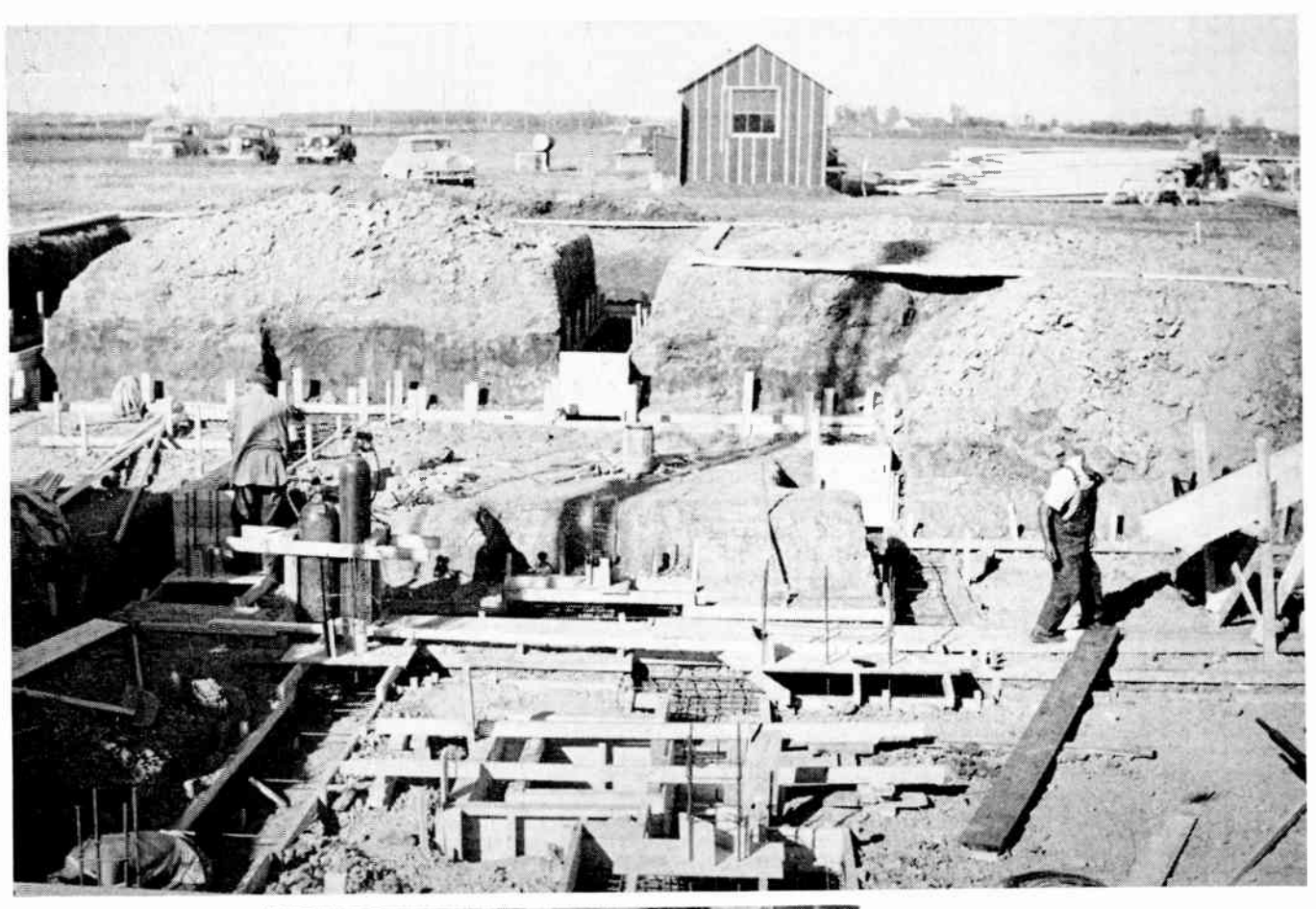
Fire buckets reduce cold for bricklayers on interior walls at Carman.