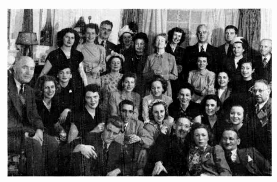
Ottawa guests at the Hutton's Moose-Milk party