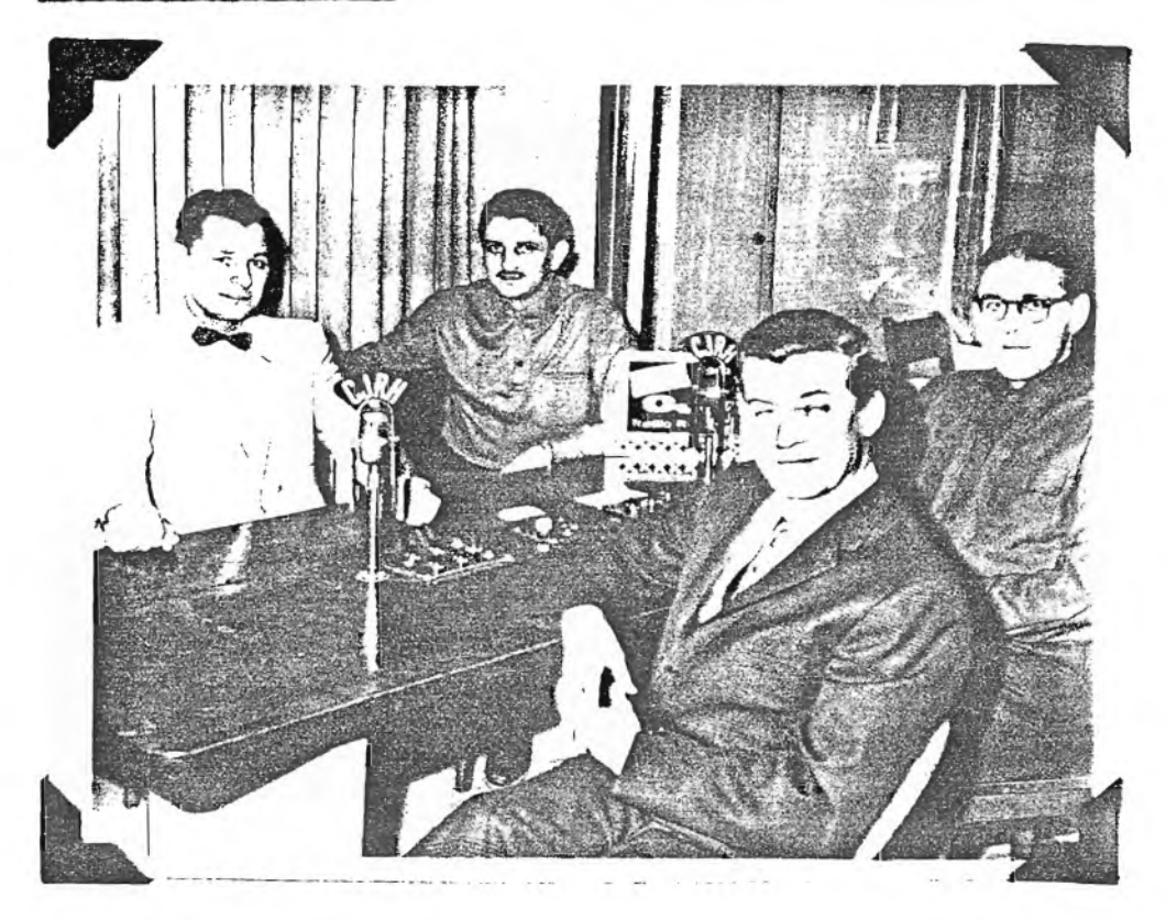
Newmarket Jaycees Discuss Mental Retardation

For the past two years CJRH has broadcast a series of panel discussions each week by various Junior Chambers of Commerce throughout York County on various municipal problems.