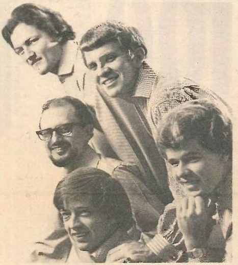
Vancouver's Nocturnals are becoming ane of Eastern Canada's top groups.