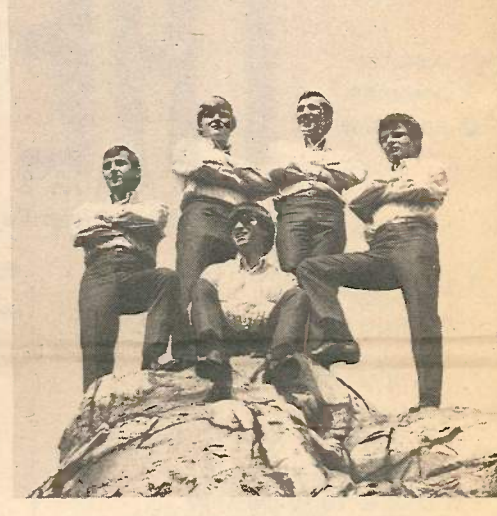
The Taxi have been creating a great deal of excitement around Sudbury.