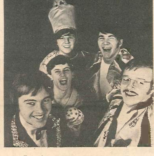
The Carnival Connection, one of Montreal's top groups, have a new drummer.