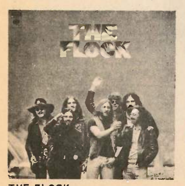
THE FLOCK THE FLOCK Columbia-CS-9911-H Newest addition to label. Lotsa punch for "progressive sound" formats. "Truth" cut - 15 minutes.