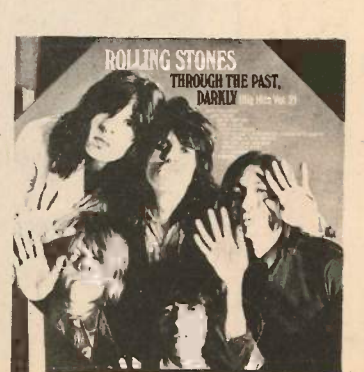
THROUGH THE PAST, DARKLY BIG HITS VOL 2- Rolling Stones London-NPS 3-K Order heavily on this one. "Ruby Tuesday" "Jumpin' Jack Flash".

ANNE OF GREEN GABLES Original Cast-Columbia-ELS-354-H Canadian Musical — taped in England where it is a hit in the West End. Excellent for MOR programming