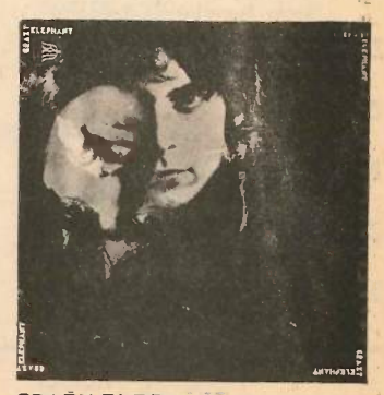
CRAZY ELEPHANT Bell-6034-M "Gimme Gimme Good Lovin" and "Sunshine Red Wine" should make this set an interesting seller.