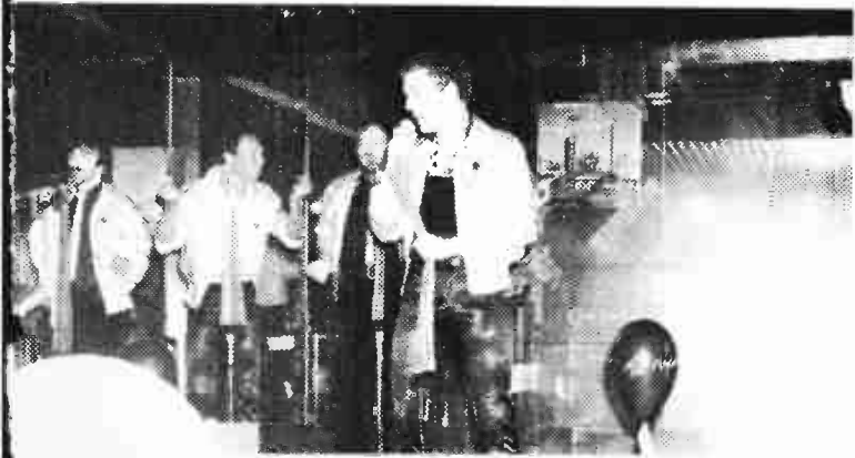
The Nylons on stage at special launch at Toronto's Stop 33, Sutton Place, for their debut Attic album.