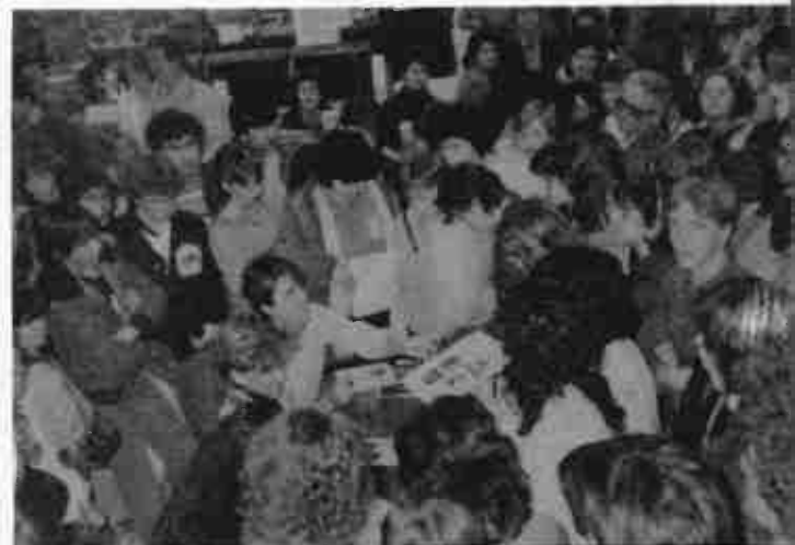
tration on in-store promotions and an aggressive overall price policy. Photos above show the success of a Spoons autograph session at the Limeridge store.