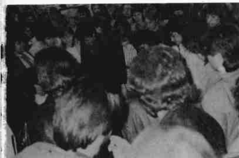
Sunrise Records and Tapes took over the servicing of the record departments in the Robinsons department stores, which were recently bought by new owners who believed in heavy concen-