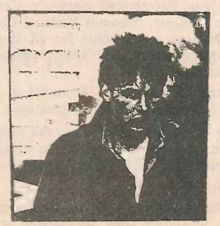
CDREY HART Boy In The Box Aquarius- AQ-539-F