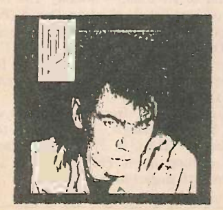
WIDE BOY Nik Kershaw MCA - 52601-J