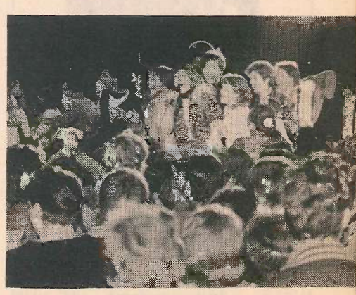
The drawing power of Katrina & The Waves is evident here at the Ontario Place Forum (May 29) where they drew a crowd of 10,000 plus fans. Their Attic single, Walking On Sunshine is now established as a hit.

Streets Of Ontario is heard on Sundays from 4 to 5 p.m.