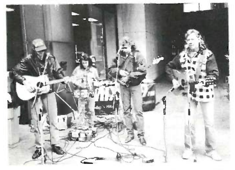
The Goods performing at the corner of Yonge and St. Clair in downtown Toronto in conjunction with the Mix 99.9's Go Leafs Go promotion.

Toronto's Mix 99.9 morning co-hosts Larry & Carla hosted a pair of Go Leafs Go morning shows at the corner of Yonge and St.