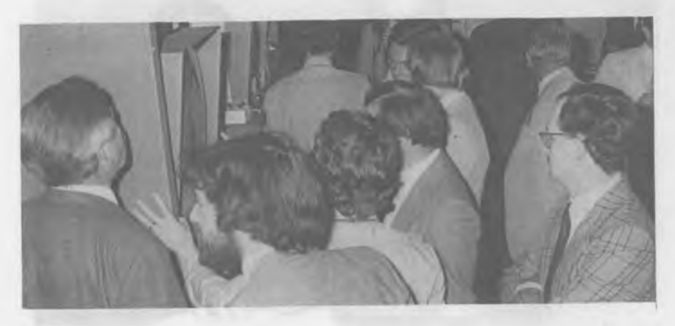
Teletrack was certainly a popular exhibit

The set will provide fourteen waveforms selected either manually, by a single logic control line, or automatically by a user-programmable sequencer. The sequencer allows each waveform to be available in 10-second steps from 0 to 999 seconds. Two