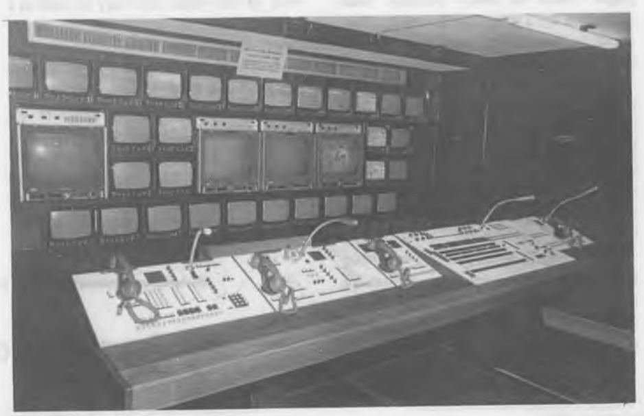
The rack of 34 monitors and the control desk in the extended production control room

The sound control room at the rear of the vehicle contains a 44-channel Neve stereo sound mixer and a central communications system, based on a 50 x 100 pin-board matrix to give the maximum operational flexibility.