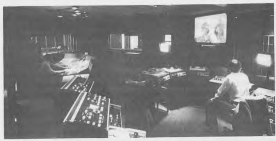
View of the multi-role dubbing theatre in action

Contact us on London BH 5432/5433 with your comments or your news