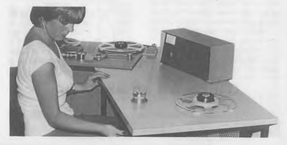
Sue Tubb, DD, seen operating the Tape Reclamation equipment

mono. The new machines however do not allow the sensitivity of the tape being processed to vary beyond our specification for new tape. They do not accept jumps in sensitivity across splices of more than 0.8 dB and also, because of their physically weakening effect on the tape, they do not permit splices to occur too close together – usually not less than 100 feet apart.