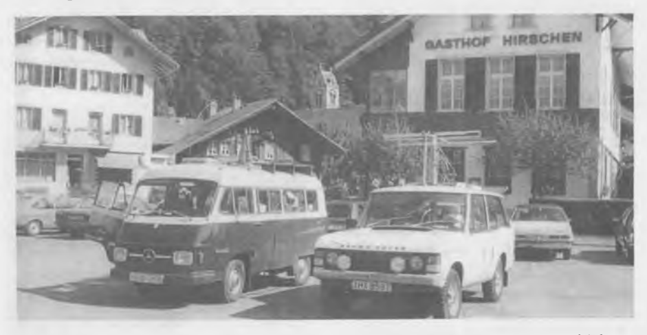
The EID Rangerover seen with the German fieldstrength measuring vehicle at Wildersvil, Switzerland during the data signalling tests

which were produced by Tele-Verket of Sweden, TDF France, NOS Holland, YLE Finland and by BBC Research Department, are an addition to existing VHF transmissions in the form of a data-