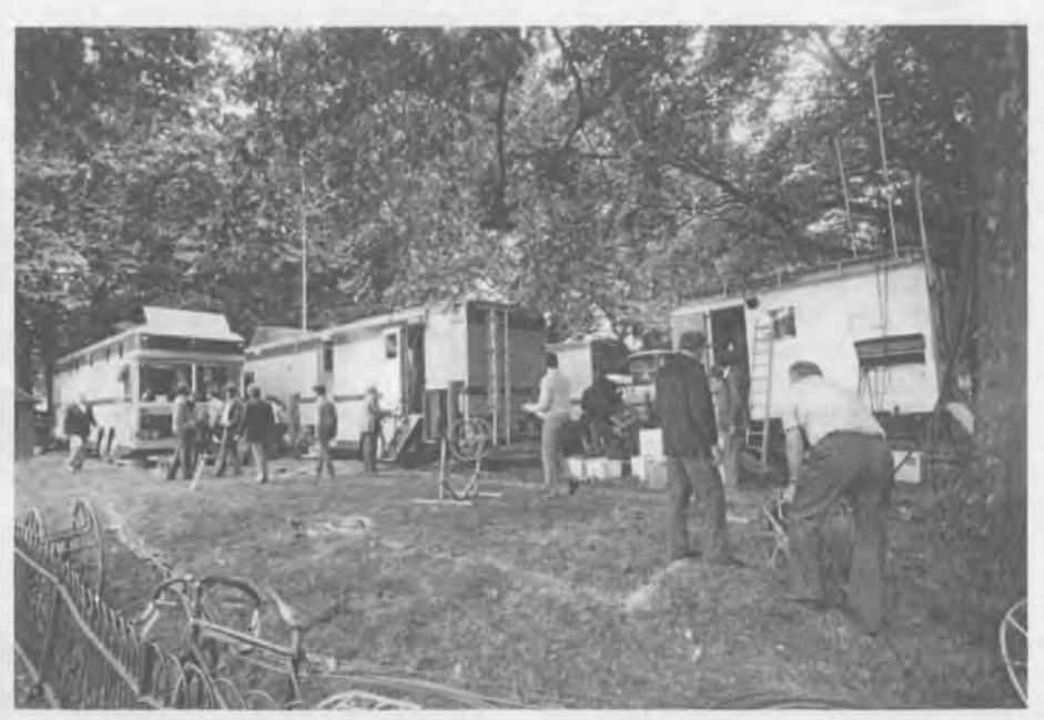
Radio OB caravans at Canada Gate

In The Strand, Don Craske had brought a three camera CMCR from the Open University production centre at Milton Keynes. Link 110 cameras had been removed from the studios for the broadcast, and these were mounted on Simon hoists which had been parked in side roads leading from The Strand. A 'continued on page 4'