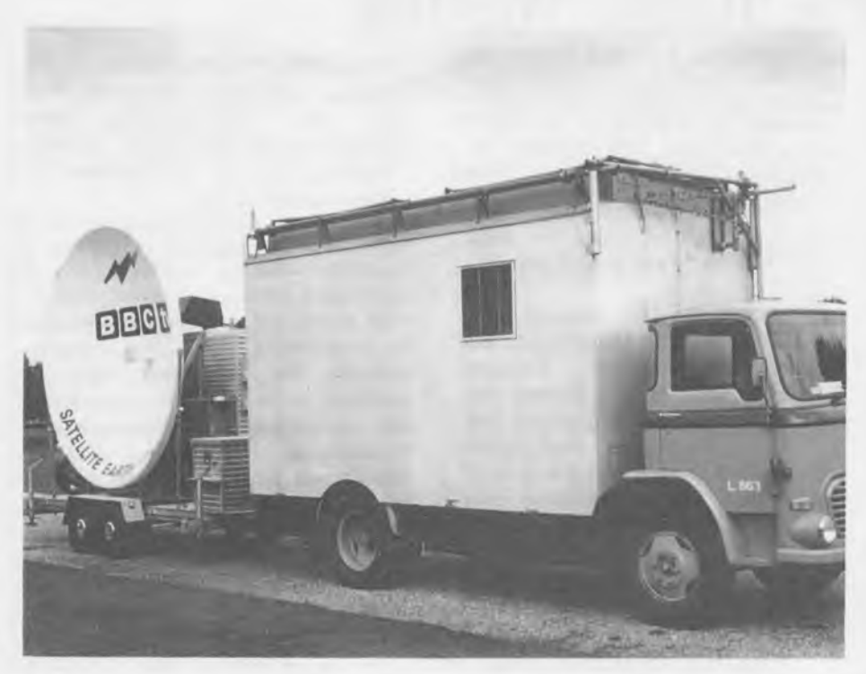
The vehicle and trailer ready for the road

The mobile satellite link terminal commissioned for Television Outside Broadcasts has just been completed by Research Department, and is undergoing pre-operational trials prior to programme commitments starting next month.