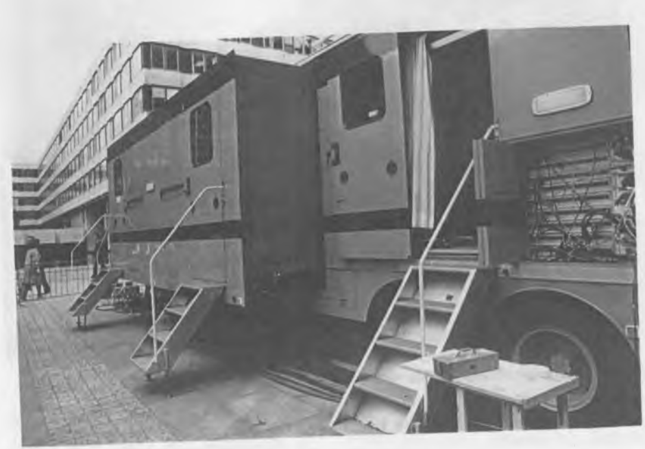
The expanded sides of the CMCCR 2

With CSI there are few problems. The lamp is well tried, reliable and because it is compact - did not dominate visually or take up too much room in the Cathedral. Heat generated is modest and is readily conducted away by fins on the lamp housing. Musicians, though always concerned about any nearby sources of heat, were far less likely to be put out by CSI than by the sources we might have used a few years ago.