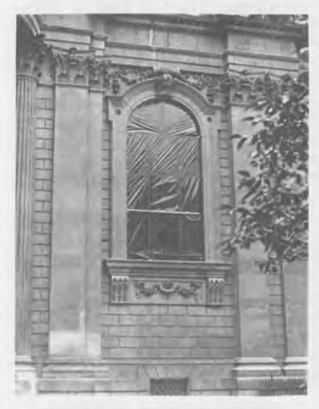
The orange plastic filter stretched over one of the Cathedral windows

Other cameras were positioned behind the Royal Family and Earl Spencer's family in the N.E. and S.E. Transept aisles. They were able to provide frontal shots of the respective