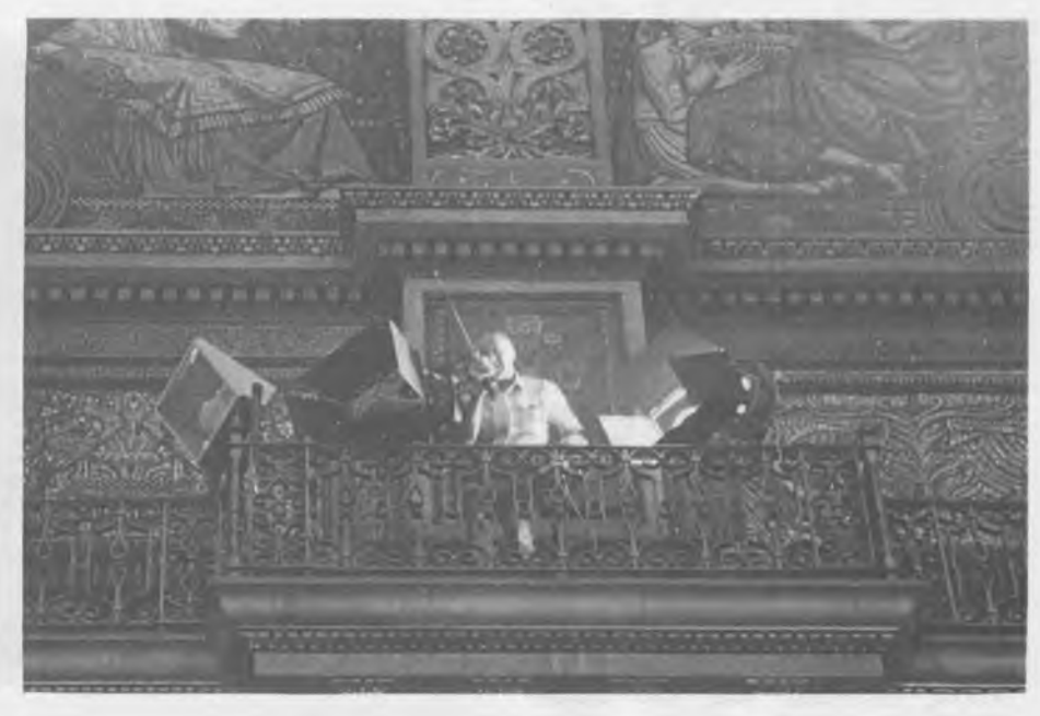
Lighting equipment in the triforium is adjusted

families as well as side shots of Prince Charles and Lady Diana, also shots of guests sitting under the Dome area mainly close friends of the Bride and Groom and the Crowned Heads of countries around the world. A camera placed just above the North Choir stalls gave an 'over the shoulder' (the Archbishop's) shot of the couple. Two more cameras placed at East and West sides of the Whispering Gallery were able to zoom the length of the Nave and to the Altar. One final camera - giving the now well known shot looking vertically down from the centre of the Dome completed the disposition of cameras within the Cathedral.