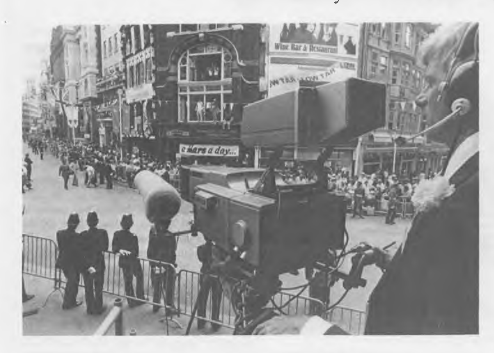
BBC cameras were in position long before the procession passed

Wedding an extra eight monochrome monitors were mounted on racking; the additional space created by the expanding sides allowing plenty of room to accommodate them. The extra space also allows greater freedom of movement for staff around the control desk. At the rear of the vehicle is a sound area with a 44 channel Neve stereo sound mixer and a central communications system, the heart of which is a 50 x 100 pin-board matrix which enables the system to be tailored to suit each broadcast. The front of the vehicle contains engineering and vision control, where all of the vision signals from the smaller CMCR's were fed to the CMCCR allowing Michael Lumley the Producer, to have complete production control.