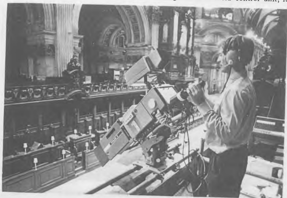
This camera covers the North Choir during rehearsals

In my view, CSI was the only practical choice for this event. In the old days, we would have had to rely on 10kW tungsten lamps, with their attendant problems of bulk, weight and heat. I have calculated that our total electrical load for lighting would then have been 1.6MW rather than the 690kW we actually used. CSI has proved to be a valuable lamp for OB's; the BBC was the first to recognise its potential in our specialised field and worked closely with Thorn as they developed it as a source able to meet the stringent requirements of TV lighting directors and film cameramen. We have now used it successfully for a decade. The lamp has revolutionised location lighting of some events, and without it we would have needed two or three times the 17 tons of lighting equipment that was eventually moved into St. Paul's. The only other possible alternative, CID lamps throughout the Cathedral, would have resulted in even better colour rendering for the cameras, but would have meant a 15% power penalty. In any case, the CID lamp while promising much for the future is still relatively new and we could take no chances on this occasion.