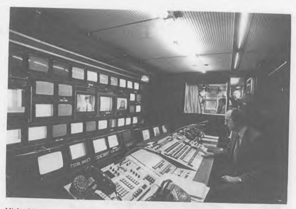
Michael Lumley checks out the mixing desk in the CMCCR2

At floor level, under the Dome there is a seating area of some 150 feet in diameter. The nearest position for lampheads is in three of the four quarter domes, the fourth being forbidden territory - it's full of organ equipment! The quarter domes are above the level of the Triforium and even further away from the subject. For such a large area and a tremendous throw for the lamps, I used three Dino-lights on molevator stands each with 24 x 1kW PAR 64 Thorn lamps, colour corrected to match CSI: they provided an incident level of 1,400 lux. To this I added 12 x Twin CSI bringing the level up to 1,700 lux the CSI's providing that extra punch