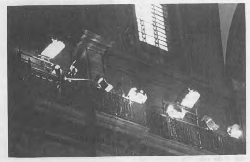
Lighting the Wedding required some 270 or more luminaires

When I had completed my lighting plot, a number of visits were necessary 'continued on page 6'