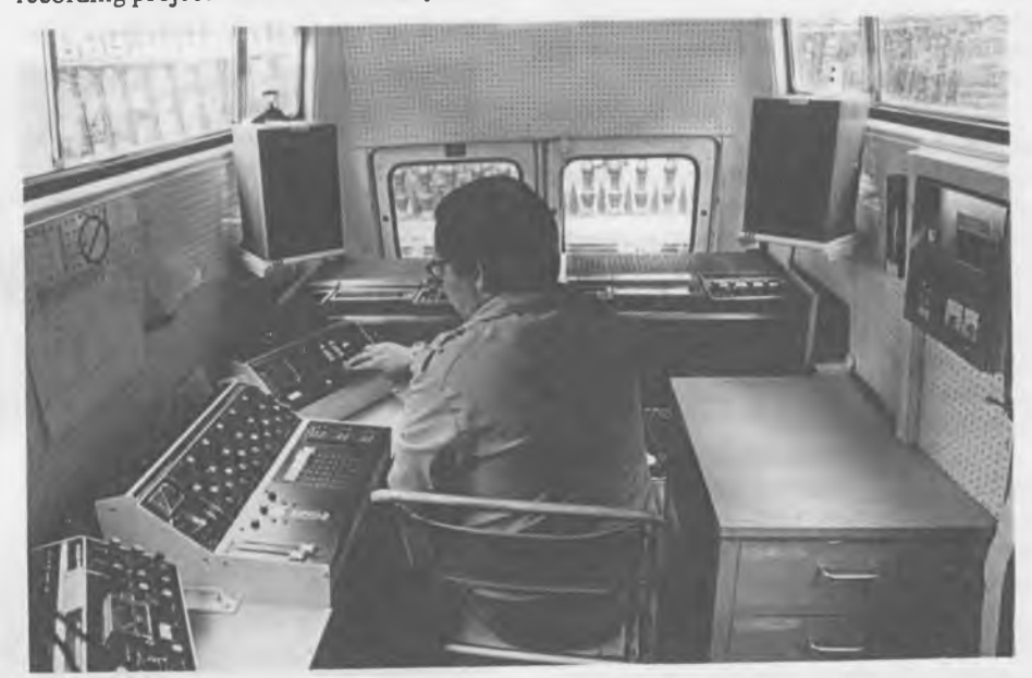
Dennis Yee in the digital sound recording vehicle

Setting the sound-field microphones was relatively simple: each unit's four encapsulated microphones combined with a matrix processor gave the system a unique versatility enabling an extremely wide range of operating modes to be electronically selected. In the Cathedral each sound-field microphone's physical height was set 'continued on page 12'