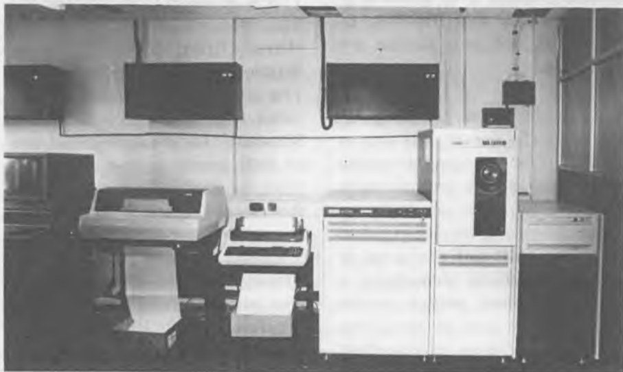
The new computer in Schedule Unit

From September 1960 until the summer of 1980 four schedules were drawn up each year - the first covering the two month period of the Spring Equinox, followed by a four month period covering the Summer, a second two month schedule for the Autumn Equinox and finally a four month period covering Winter - this being the pattern determined by international agreement at the Geneva Frequency Conference of 1959 and which is still operated today by most international broadcasters. In 1980 most European Governments adopted a measure of energy saving, and agreed to have a defined period of Summer-time, which in most cases begins on the last Sunday in March and ends on the last Sunday in September. This immediately presented Schedule Unit with considerable problems since not unnaturally, programme makers in Bush House wished the timing of our