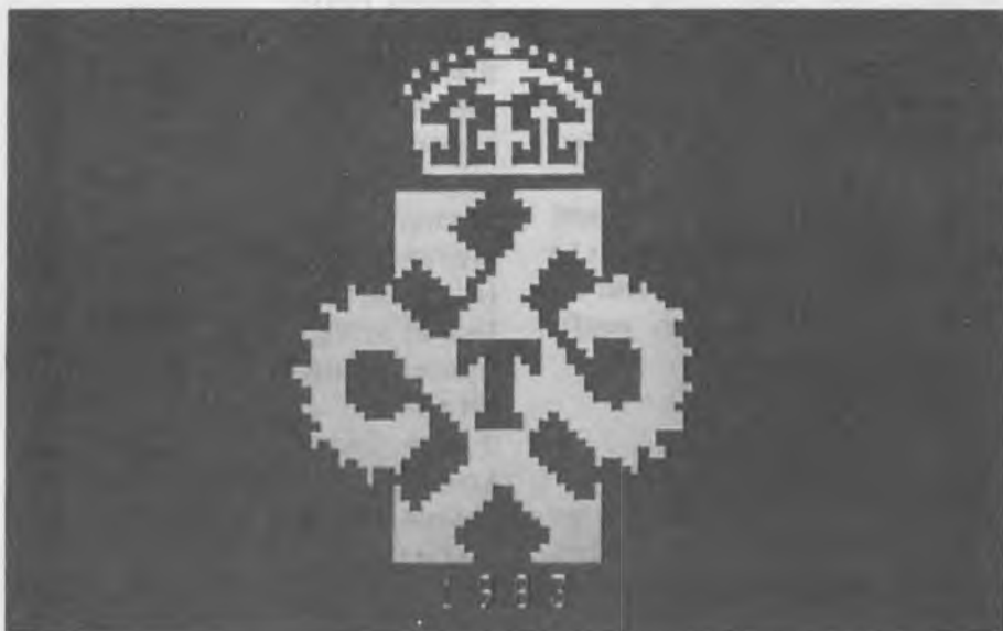
The Queen's Award Logo, as displayed on CEEFAX

The BBC has been awarded the Queen's Award to Industry for the third time. The Award goes jointly to the British Broadcasting Corporation Engineering Directorate and the Independent Broadcasting Authority's Engineering Division for their pioneering work on the development and transmission of Teletext, the basic concept of which has been adopted worldwide.