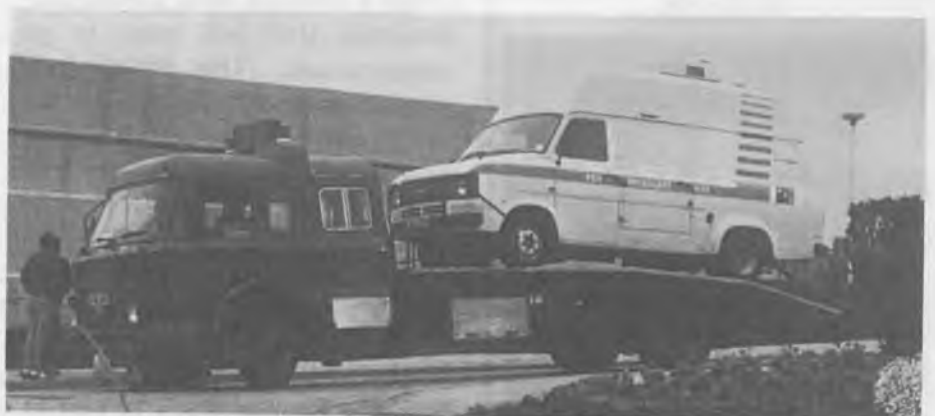
The hired unit arrives in Manchester in style

Election Day itself was characterised by the calmness of systematic activity, when all the fume and fret of frantic planning was over, nervous breakdowns avoided and everything worked, we had two local ends to spare, and we had another comprehensive file which, probably, will be of just as little use when the next time comes!