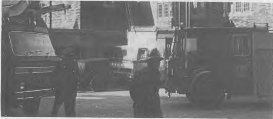
A Manchester based communication vehicle hides itself in Carlisle Fire Station

The success of "Election '83" was largely due to the contribution made by staff in the regions and at the OBs. A brief glimpse of the large operation shows not only the facilities used, but also some of the lighter moments that occur in any programme of this nature.