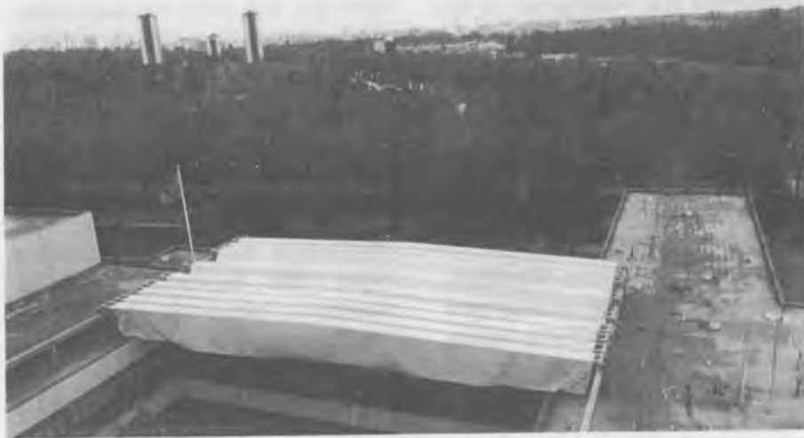
The temporary canopy ready to be extended over the courtyard

"6.55 Special", from the BBC's studios at Pebble Mill, took on a new look for the summer season. The construction and erection of a temporary large canopy over the courtyard at the Mill has enabled all-weather production of the programme in an external environment. The landscaped gardens provide an ideal setting for the lively musical groups and other items that appear on the programme.