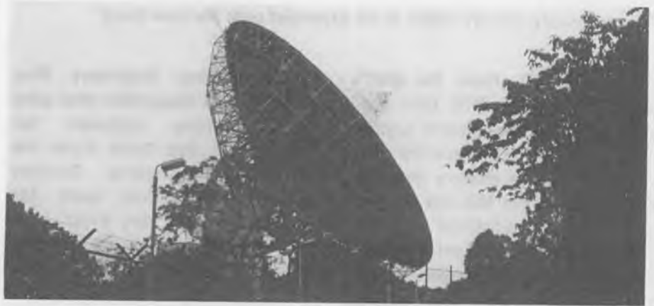
Singapore Telecoms satellite earth station, Sentosa

Planning of the system was undertaken by Communications Department and installation of the special pcm satellite receiving equipment with its associated distribution system in Singapore was carried out, in under nine months, by engineers from Telecoms Singapore in conjunction with the resident engineers from the BBC transmitting station at Kranji. In the United Kingdom, British Telecom International have modified the transmitting equipment at their satellite Earth Station at Madley in Herefordshire to handle the special pcm signals,