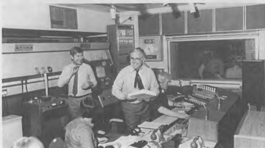
Members of BBC World Service's Election Special Team in the special events suite at Bush House