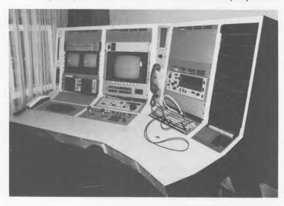
The PSC suite control desk at Pebble Mill

All the electronic assemblies are built on 3U eurocard format and are housed within the condesk. trol Interconnections between the control panels, subracks and distribution panel have been made using ribbon cable, even the bantam audio jackfield was terminated into eight 50-way ribbon cables. The routing is also extensive and maintains the twin-track distribution provided by the rest of