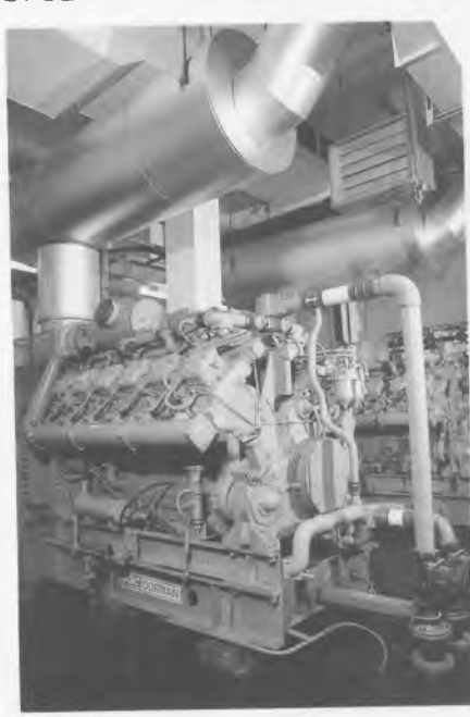
474kW turbocharged V12 generating sets in BH sub-basement engine room

mains the Whenever supply departs from its the new limits, normal generators are automatically started, paralleled together, and connected to the essential electrical services, such as the control room, switching centre, continuity suites, and telephone studios When the public system. supply returns, a controller is used to restore the system to normal, by synchronising the generators with the mains. effecting a 'nothus to the transfer