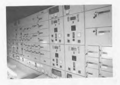
New Maintained supplies switchboard

The programmable control system is automatically self checking and the generators are comprehensively protected against unsynchronised