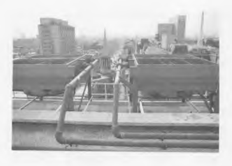
Engine Radiators on roof of Broadcasting House Extension 13 floors above the generators.

recabling of supplies to the various critical loads throughout the Broadcasting House studio area.