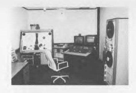
News Telecine 1 showing the Rank Cintel Mk III machine and Schlumberger sepmag facility

Before work could begin on the vt area, provision had to be made to allow telecine operations to continue. This was achieved by converting previously area occupied by a film optical review theatre into two tk cubicles, each equipped with a new Cintel Rank Mk 111