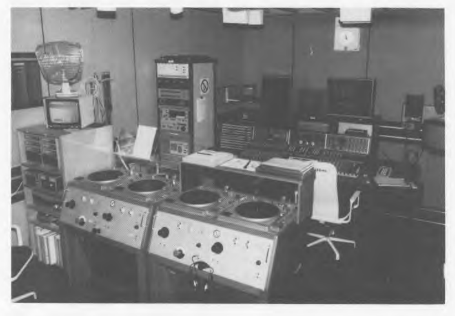
Dubbing Control Room 2

Cubicle facilities are identical and include record source and