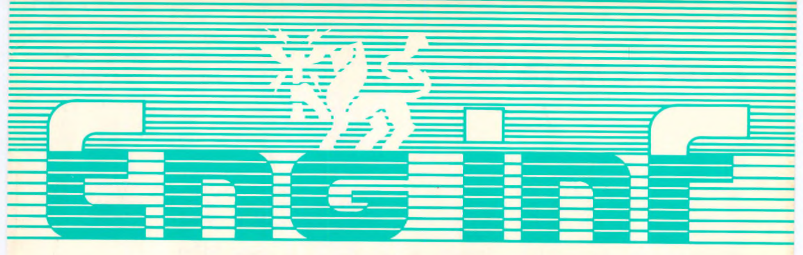
No 24 - Spring 1986 The Quarterly for BBC Engineering Staff