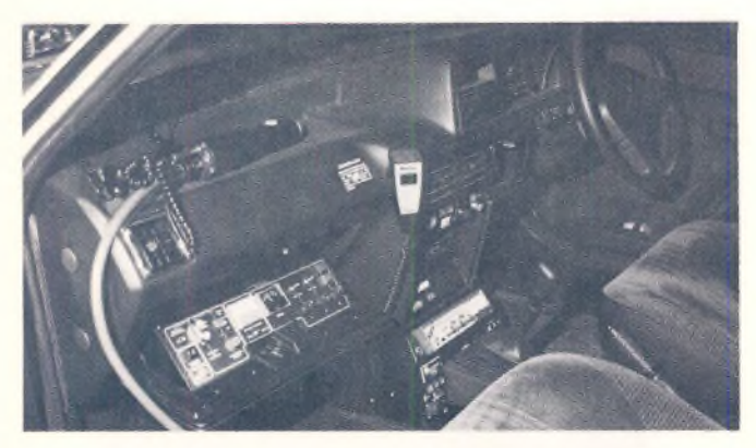
Engineers and Reporters Control Panel. Page 8 - Eng Inf Spring 1986

The audio facilities have been revised from previous cars and the best features are presented in a standardised new layout. All of the basic controls needed by a reporter are contained on a single panel mounted above the car's console. A button on this 'reporters panel' switches on the technical supplies when the reporter is ready to transmit. Before an item can be sent, the reporter has to raise the pneumatic mast carrying the aerials. The mast, which is fitted in