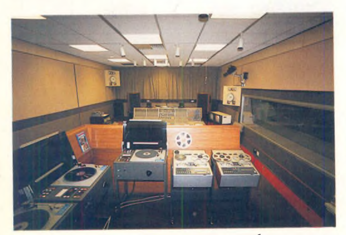
Page 16 - Eng Inf Spring 1986

The requirement for the fast editing of each episode, and the addition of "loose scenes" at the end of episodes, led to a new control desk being developed. To accompany this, a new cartridge trolley has been installed to allow the insertion of special effects. This replaced the old Programme Effects Generator, (PEG).