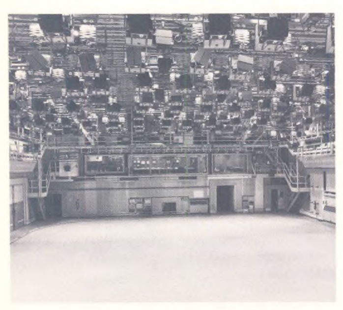
The re-furbished Studio A in Glasgow.

The sound control room was re-furbished by Calrec, who have installed their own 58-channel desk. (The existing desk was only 9 years old, and the remainder of it's useful life will be spent at ETD Wood Norton.) The sound facilities include three gram decks, three 1/4 inch tape machines and an Otari 24-track recorder, plus a range of distribution amplifiers and monitoring equipment. The successful TC3 type EMX has been installed together with a comprehensive