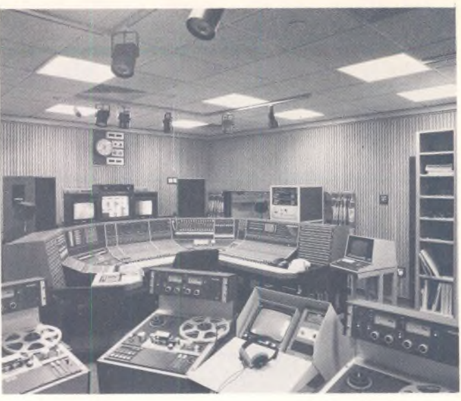
Glasgow Studio A: Sound Control Room.

Philip Drake Electronics Studio Communication System.