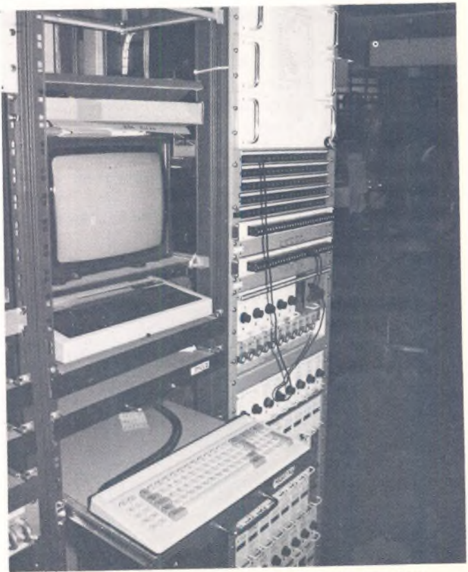
The satellite control equipment in ICR.

Software for the project was contracted out, but the chosen software house was unable to maintain a constant design