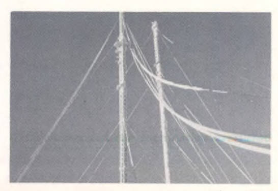
Eng Inf Spring 1986 - Page 7

On February 18th, one of the temporary stays supporting the rusty, partially dismantled, old mast shed part of its load. Since then, falling ice has caused severe structural damage to the transmitter building and some damage to the main feeders at the base of the new mast. In one instance, a block of ice measuring 6' x 6' x 2' fell off the cylinder of the old mast and crashed through the reinforced concrete roof.