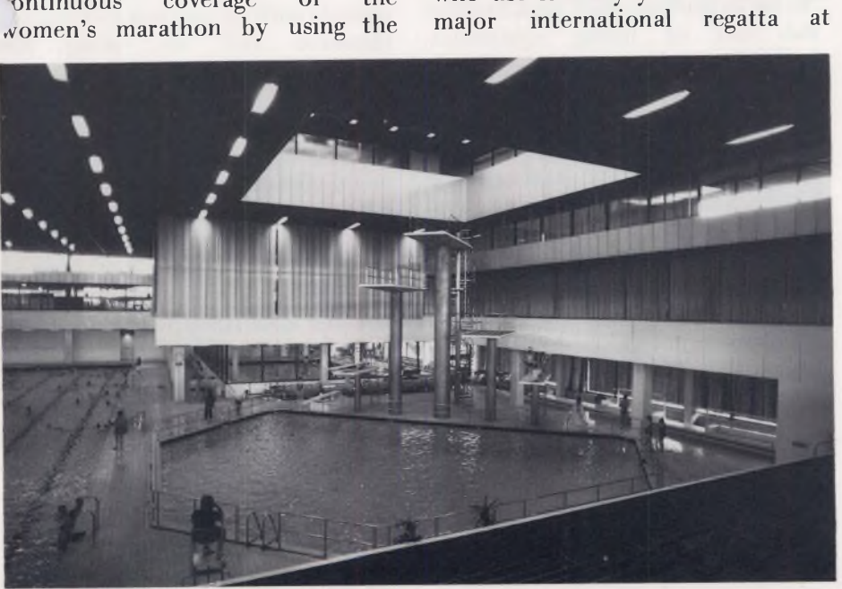
The diving poolat the RCP is being used for diving and synchronised swimming.

Rowing has not featured in the Commonwealth Games since 1964. This year's competition is at the new Scottish international standard Strathclyde Loch course between M74 alongside the Motherwell and Hamilton. Scottish course is very attractive, being set in the landscaped surroundings of the Strathclyde Country Park, but the pleasant surroundings have given us a new problem to solve. The course is 2000 metres long and the crews race six abreast. To cover the races effectively we need cameras which can move alongside the boats and look across the course - the following camera technique used in the Boat Race won't do for six-lane racing. Although the edges of some six-lane rowing courses are straight allowing the use of lorry-mounted cameras the edge of Strathclyde Loch is curved. As a result we need to mount the cameras on a boat which can travel as fast as the crews which produces only minimum wash so as not to disturb the crews. The boat used is being borrowed from Swiss television who use it every year to cover the international regatta major