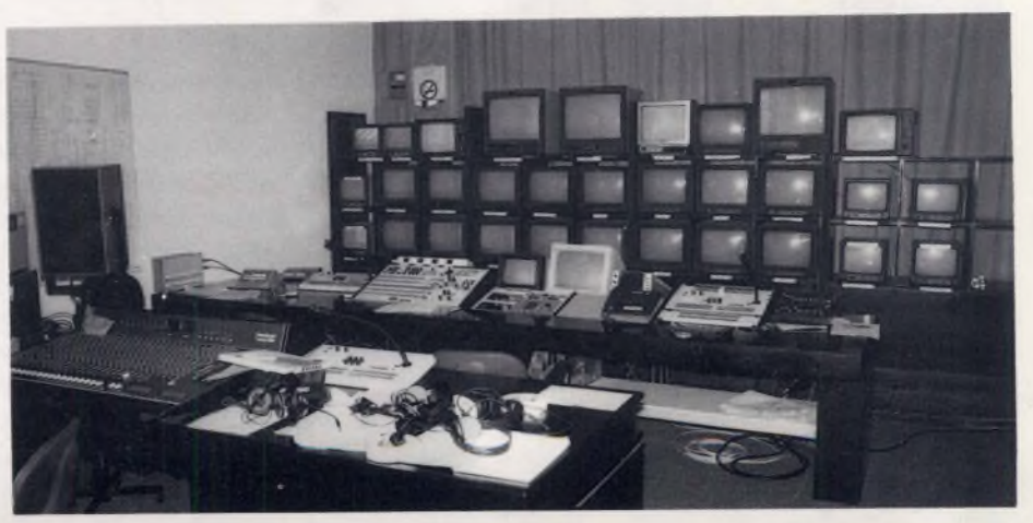
HB television suite gallery.

The large presentation studio (area 45 square metres) has two 130 and has cameras suspended luminaires controlled by twelve 2 kW dimmers. The vision system in the gallery is centred on a Dynamics 32-channel Central mixing desk which, at some time after the Games, is to go into the CMCCR. Only 24 channels of the desk are being used with sources from the two cameras, twelve venue circuits, four circuits from the VT