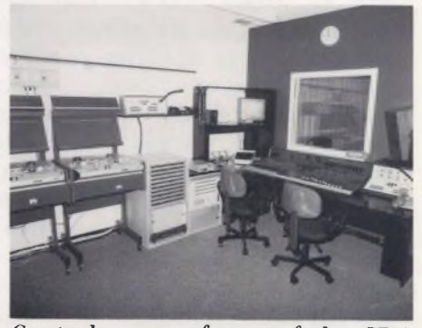
Control room of one of the CBA radio studios.