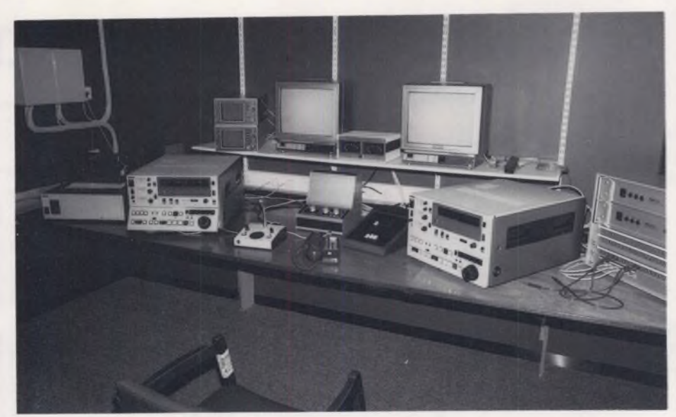
BVU edit suite for BBC English regions.

Ventilation, with chilling for television areas, is provided by air handling units, some of which may be used afterwards in local radio studios. While it has been necessary to provide dust silencer units to maintain the acoustic isolation, ductwork is of lightweight flexible material which economises in both direct and installation costs.