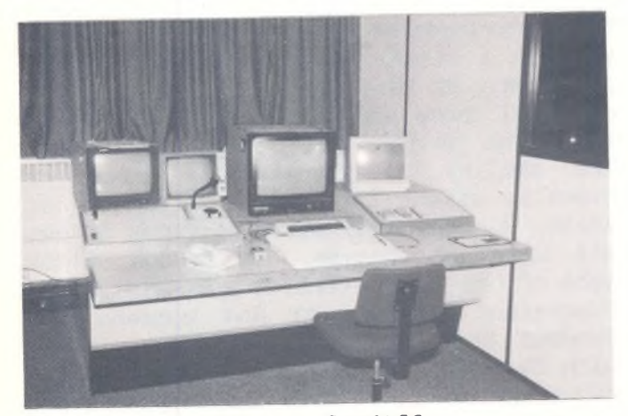
The Paintbox area in Cardiff

The area has a central RGBS matrix (16 inputs by 8 outputs) for routeing signals, in component form, in and out of the painting systems. In addition, a coded matrix (again 16 X 8) allows comprehensive monitoring of all sources and outgoing lines. The two matrices are manufactured by Abekas Cox, integrated in one unit, and controlled by an 8-bit processor which utilises the SMPTE control protocol, with distributed processors in the control panel modules. This system allows additional control panels to be added