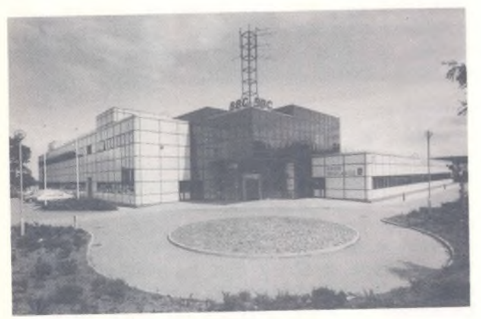
Newcastle Broadcasting Centre