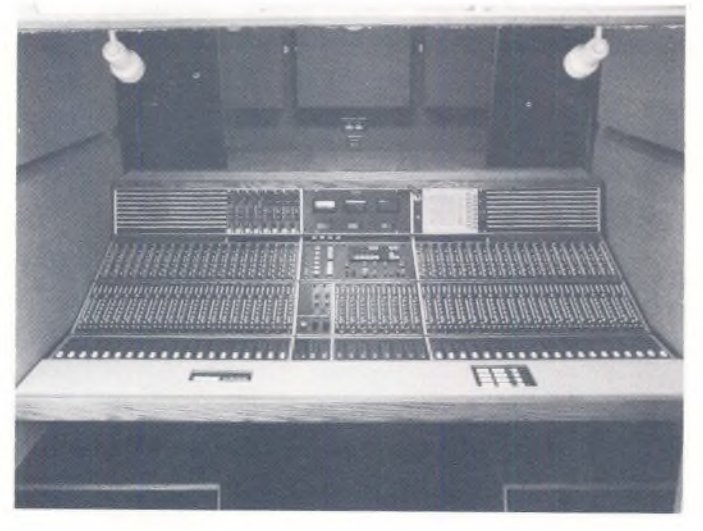
The Type B's Calrec sound desk

A selector on the desk gives the operator both PPM and loudspeaker monitoring of thirty-eight points in the system. The loudspeakers supplied are the large BBC LS5/8A professional units while a pair of Foster 6301XT domestic quality speakers allows him to empathise to some extent with the listener, by simulating the sound from the average home stereo system.