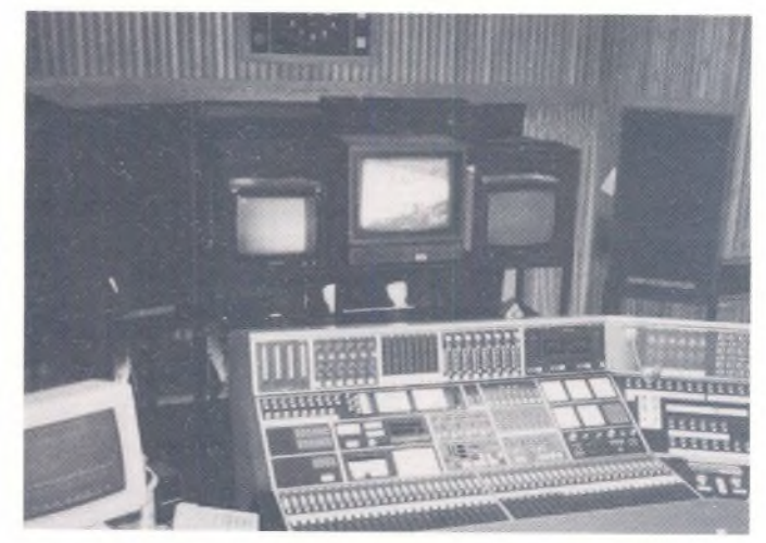
The new 'assignable' sound desk from Calrec, in TC Studio 4

Operationally the desk is simple to use. Pressing the appropriate assign button above the fader causes the settings of the channel to be instantly displayed on, and controlled by, the assign panel.