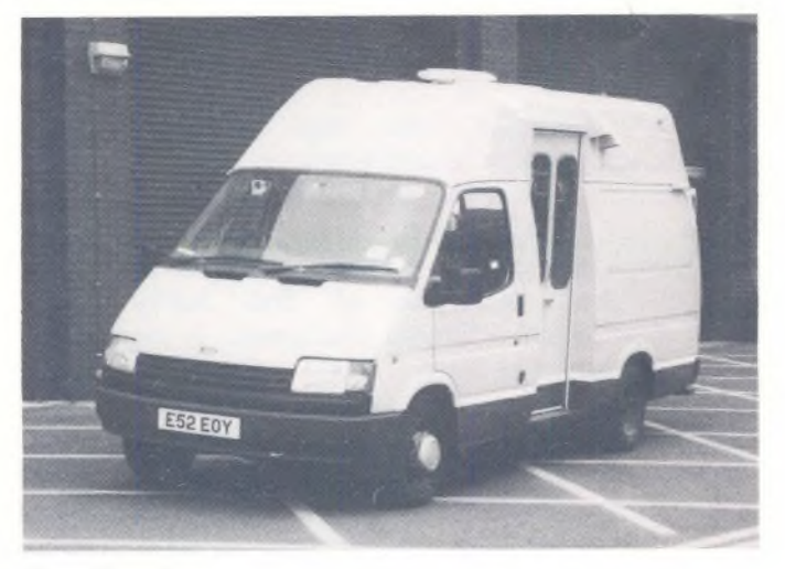
The New Type C vehicle

a separate 24V technical battery which the vehicle's alternator can simultaneously charge, along with the vehicle's 12V battery.