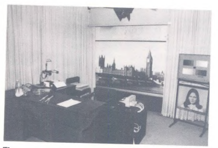
The remotely-controlled Westminster Studio with its familiar backdrop

News & Current Affairs' Westminster studio has recently undergone a much needed refurbishment. Located on the ground floor of the Norman Shaw Building, near the Houses of Parliament, the studio is now fully integrated into News TAR and will soon be extended to N1, N2 and N3 at TC. Remote control has been provided for camera movement and functions, lighting, audio levels and cues. Also, the heart of the studio - an 8 x 4 Probel matrix - can be controlled from SCAR at The Centre.