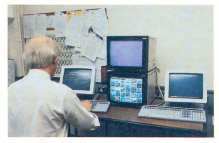
The Gallery 2000 workstation, displaying a .'polyphoto' and 'picture request form'.

electronic stills on either side. The optical discs are described as 'WORM' write once, read many - which means that the stored digital image can never be erased although it can be accessed as often as required. Thus the medium is extremely robust, with a quoted storage life of greater than 30 years.