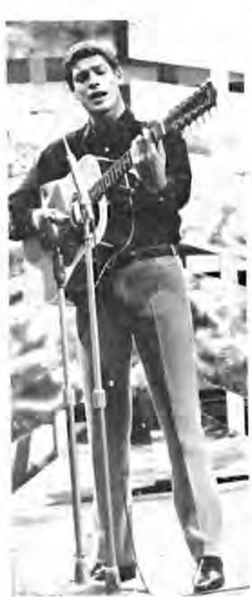
12 string was an important factor in the Seekers' sound.

The simple things usually come out best. The fuller sound of the guitar means that one chord will sound fine when on a six you'd have