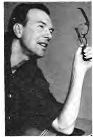
The legendary Pete Seeger—an innovator of the 12 string.

Though Blind Willie was an influential early figure, the great man of the 12-string turned out to be Leadbelly. His ringing Stella guitar was to