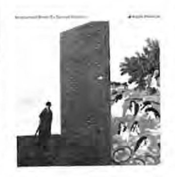
GEORGE HARRISON APPLE SAPCOR I

Apple's first album, this is a good record without being a dazzler. But then, that's what film music is supposed to be-effective within the context of the picture, but not obtrusive. It has to take second place. Viewed in this light, it would seem to be a success (though I haven't seen the film) and at the same time it's well worth a listen. Subtle and full of nice things, it's very Indian (Red Indian too) as might be expec-ted, since it was recorded in December 67. I like it very much.