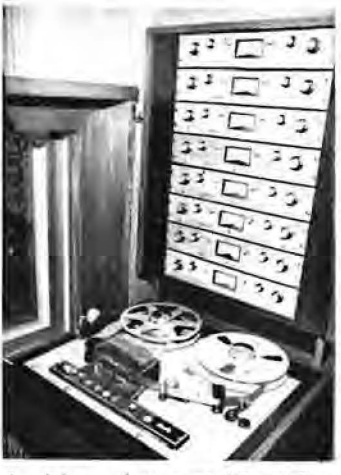
An eight-track tape machine at Pye.

We recently received a letter from Ron Pickup, a British