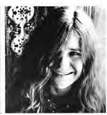
Janis Joplin's new band may make its debut on New Year's Eve.

Great news! here's the best catalogue you've ever seen about the best equipment you'll ever play