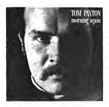
TOM PAXTON ELEKTRA EKS 74019

Gone is the Tom Paxton of old, perhaps a little bit gutless and cleancut. This album is a real change of direction for him, and a very rewarding change at that. The smooth voice is still much the same but the subject matter is more outspoken—songs about the U.S. army in Vietnam, getting high with the fruits of "Uncle Ho's victory garden", about prostitutes—and the backing is more spiky and punchy. The album is yet another expression of disillusionment with the American dream, but it's a good deal better than most.