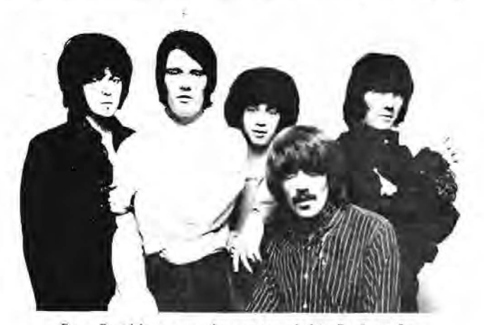
Deep Purple's new single was recorded in De Lane Lea.

Tony Pike studios in Putney have recently been recording the Gilded Cage. This is an