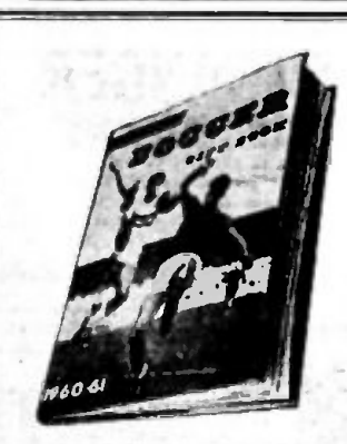
AN IDEAL PRESENT

sung to a tush urganoria accompaniment. That song from "Bells Are Ringling." The Posty's Over, turns up again for the turnover. Annia single it with a remarkable blend of wormth and clienty. Accompaniment from a suff chythm group is first-rate.