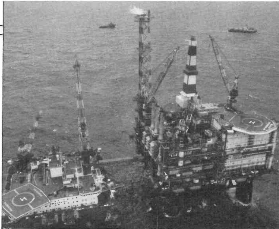
Magnus production platform (right) with accommodation vessel Polycastle, 110 miles NE of Shetland.

About half way through the event more trouble came to light. We seemed to be breaking through onto the platform's 'Order Wire' communication system. An ATU was in circuit, providing an apparently perfect match to the aerial on all bands, and the FT101B seemed to be working correctly. What could be causing the interference? GM4BDC, another platform technician, suggested removing the ATU from the circuit – a further length of coaxial cable had been added between the aerial and the ATU output in order for an easy connection between the two. Could something be amiss here? The ATU was removed from the circuit and the FT101B fed straight to the antenna via a low pass filter. Result? No more interference!