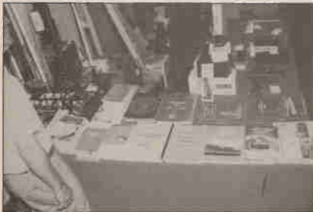
Waters and Stanton field a fine array of books, as well as all the hardware.

As the rustle of boxes and packing paper grew to a crescendo we grabbed the quiet moment to take our photos and left. People were trickling away slowly, so no traffic jams. Very pleasant. Thank you, RSGB.