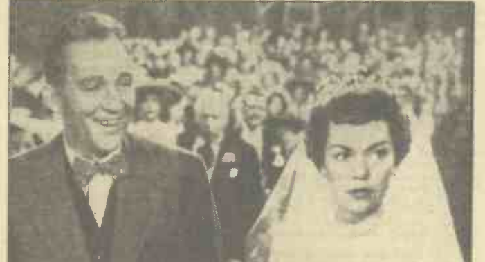
Bing Crosby and Jane Wyman in "Here Comes The Groom."

THE rooty-tooty treatment of "Shanghai" does the Trio less than justice. Instrumentally and vocally, this is as palatable as plain boiled rice. "Riley's Daughter"—like "Sweet Violets"—is another edited version of a popular army song.