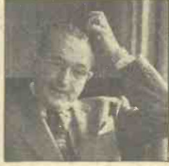
"Bop? Those kids killed it."

think it has something. The whole trouble with it is that it must be played by a master—so if I have a grouse against bebop it is that it has helped kill many, many up and coming youngsters." I raised an eyebrow. "I mean just this," he said. "When bebop first started, all the young musicians thought, 'This is the greatest thing that has ever come out of music.' So they stopped playing scales and they started playing bop. "Bop, of course, can only be played by masters. An unfinished musician playing bop is an earkiller."