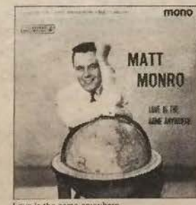
Love is the same anywhere Parlophone PCS3020 ® PMC1151 @