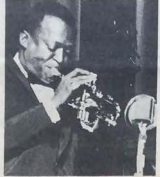
MILES: searing through the changes.

The material is more or less typical, and all are taken at faster than usual tempos—a sign (as Billy Taylor notes in his sleeve contribution) of the jazz truism that the more familiar the tune the faster it is played.