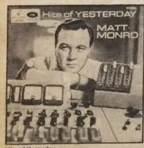
donkone PMC1265 @