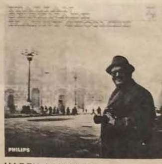
HARRY SECOMBE ITALIAN SERENADE stereo S BL 7704 mono BL 7704