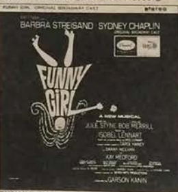
FUNNY GIRL Original Broadway Cast L.P. Capitol SW2059 @ W2059 @