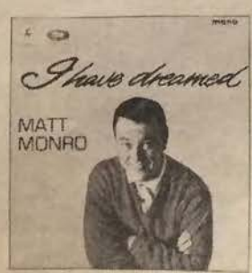
I have dreamed Parlophone PCS3067 | PMC1250 |