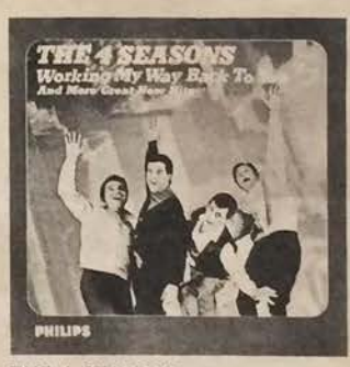
THE 4 SEASONS WORKING MY WAY BACK TO YOU BL 7699

To Curious, Golders Green — (a) Beryl Bryden (b) only on Wednesdays (c) four cards of green stamps, (d) you must have left it too close to the fire