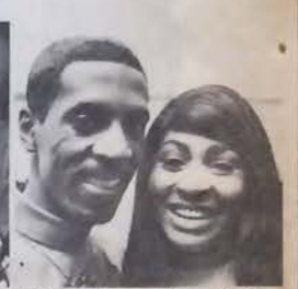
River Deep Mountain High ' by Ike and Tina Turner