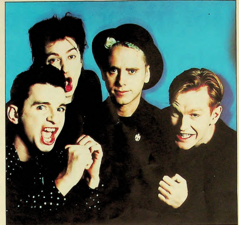
Depeche Mode have been able to achieve worldwide success on Mute

the question again: what is an independent? From Savage