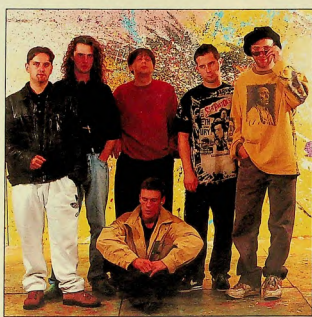
Happy Mondays: stalwarts of the indie system

Miller (in the guise of The Normal) and the Buzzcocks (with their Spiral Scratch EP) led the