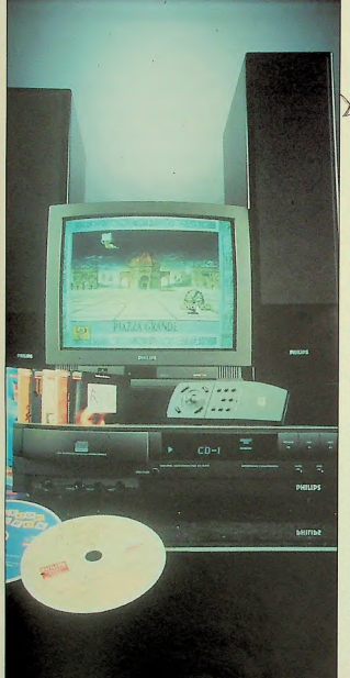
Philips CD-1: everything you need from CD-1, to CD-audio, to CD and graphics and pholo CD dises

superheroes like Mario and Sonic, the growing number of for WonderMega. Grant Goddard tests the current market