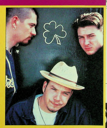
RM DANCE UPDATE 11

'Jump Around' is released by Ruffness/XL on September 28