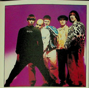
Inspiral Carnets: more inspired third album