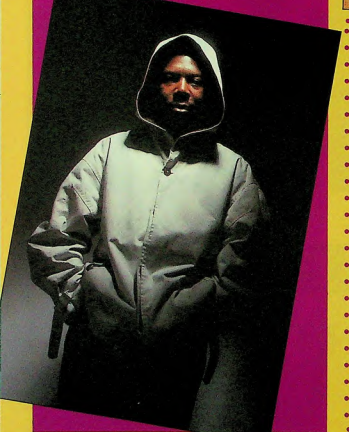
10 RM DANCE UPDATE

'Your Love Is On My Mind'/'Sunday' is released by Ruff Quality on October 5.