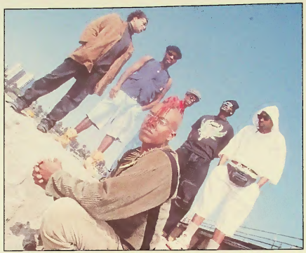
Rock with sole: Fishbone unleash another frenetic rock-funk hybrid

PICK OF THE WEEK OZZY OSBOURNE: Live And Loud (Epic EPC 473798-2/4/1: SMV