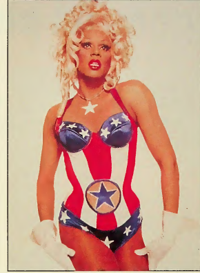
Enter with drag on Rupaul's tribute to catwalk stars out in UK

Guaranteed hanker Should do well Worth a nunt Only for the brave SOR only