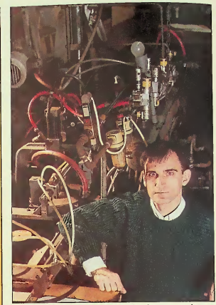
Kyle: sees more record companies entering the games market

Sony says its £10,000 Super-Bit Mapping converter adds the least noise and most closely matches the ear' response, while Deutsche Grammophon claims that its Authentic Bit Imaging, by operating at 21 bits, effectively doubles the resolution offered by any other rival system. Sony is promising a £25,000 PCM-9000 magneto-optical disk recorder this October, in the expectation that studios will want to preserve original 20-bit masters