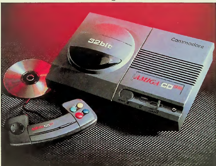
Commodore's Amiga CD32: another player in a market that has disc manufacturers licking their lips

The prospect of a new and widely publicised home entertainment platform has already prompted the more enterprising manufacturers to upgrade their production systems to meet the more exacting requirements of a new breed of CDs incorporating interactive moving graphics as well as Such upgrading involves the