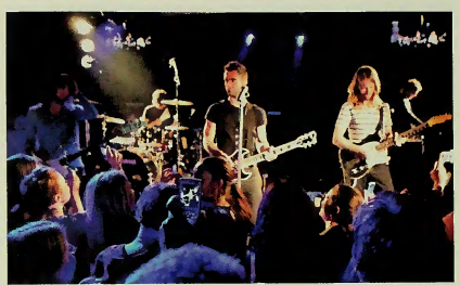
laroon 5 performing at the Nokia launch party at London's Ministry Of Sound last week

teng over-the-air download market with a la carte and subscription services