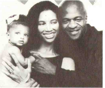
Womack & Womack - an IVA release

MCA Music Video now plans to make selected releases on a two four titles a month and our A&R to three month basis, featuring