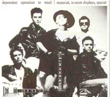
Transvision Vamp - one of the first music video releases for MCA

At PMI, Warren says specific marketing campaigns are very important: "The key areas have to be covered, and PMI pays a lot of attention to the presentation of the sales side. Initial sales kits are followed by full point-of-sale