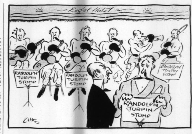
"We thought it would give a a touch of realism, that's all,"