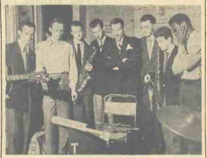
"Oh for someone to play the thing!" The Tito Burns Band tion last Wednesday failed to fill. (See story).