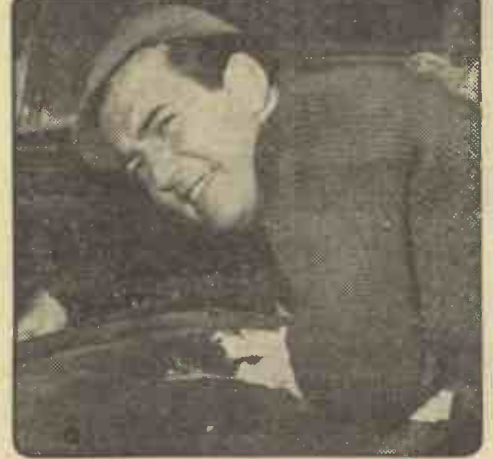
BOBBY DARIN does a repair job on a truck in Paramount's "Hell Is For Heroes," a forthcoming picture.