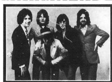
Reflections of my life