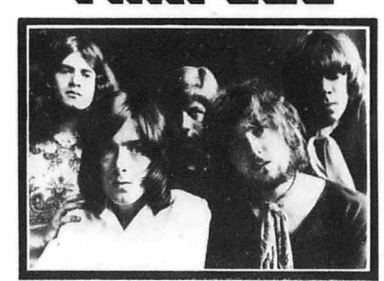
Send me no more letters