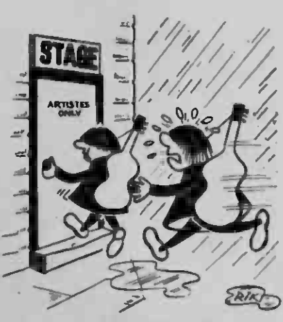
"Inside Quick!!! My hair's shrinking"