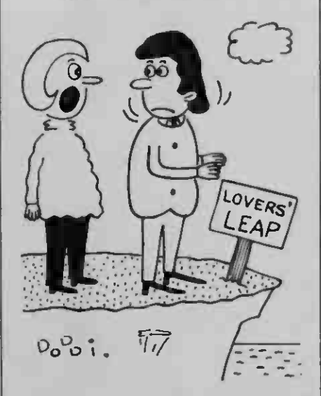
"Can I have all your Elvis Records then?"