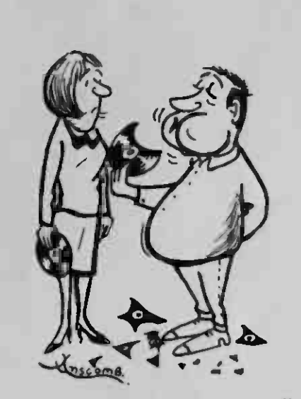
"I have a very strange taste in records"