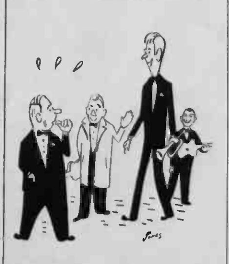
"This is our new Long Player",