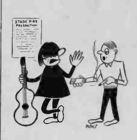
"Naw thanks mate I can't smoke—I'm a fire risk"