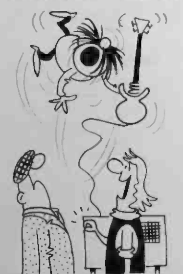
"I'm all for incorporating it in The Act but he objects I"