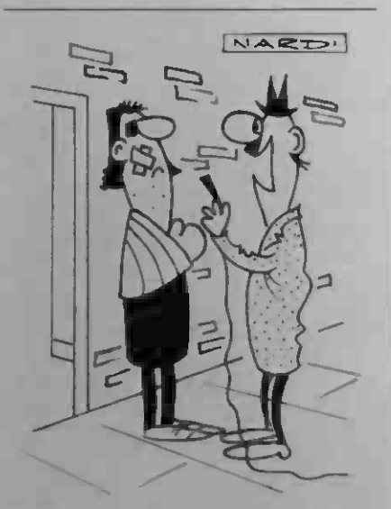
"Would you like to tell listeners about your latest Hit?"