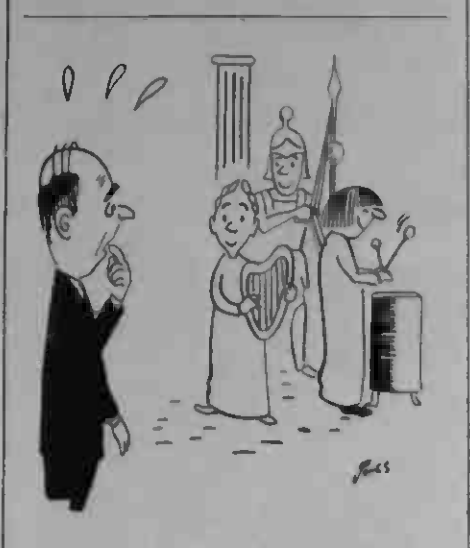
"What do you think of our new image!"