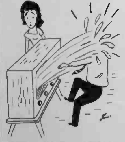
"TCHI I Got Rodio Maggle Again."