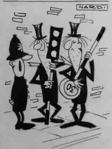
"And the Name of your Group, Gents?"