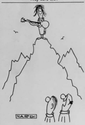
Rod always said he'd reach the top!