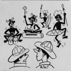
With slight adaptation, it could make the Top Ten