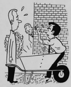
Why can't we have a van like all the other groups?