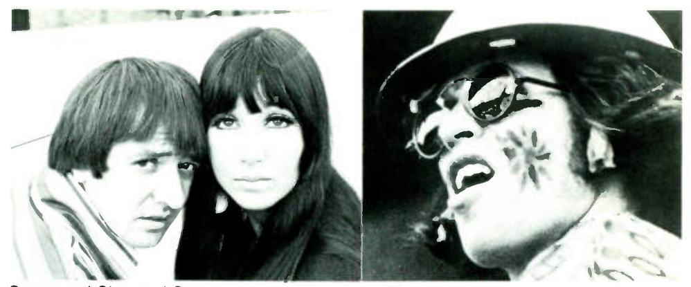
Sonny and Cher and Country Joe, performing at Monterey.

So, by the end of 1965, protest was 'in' as an accepted genre in commercial records, with all the conventions (usually culled from Dylan) described earlier. Scores of singles appeared, usually oneoffs by artists jumping on the protest band-