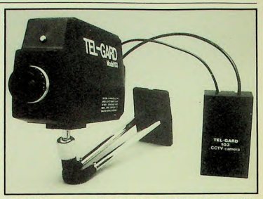
TELGARD ty monitors - £500 for the real thing, £29.50 for a simulated model

American system - turnstiles and a sec on the market that can be applied to urity guard, with customers leaving their bags at the door. TV monitors are