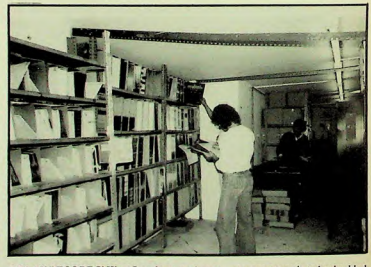
RELAY RECORDS' West London warehouse - storage space is to be doubled later this year

"The market exists and if we don't cater for demand someone else will"