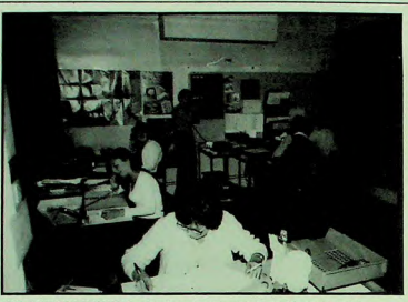
RELAY'S TELEPHONE sales department - introduced two years ago

"The merchandisers can be far more selective," he said. "Record company choices are seriously limited in many cases. The tv merchandisers have been in ty advertising for years and they are THE RELAY Warehouse.