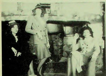
THREE DEGREES WITHOUT YOU (Ariola ABO 208)

Following the principle that its best to stick to a winning formula, this cut is in much the same mould as 'My Simple Heart', although perhaps lacking some of the immediacy of that song. The Faltermeyer/Moroder production is up to their usual standard, and perfectly tailored for radio play.