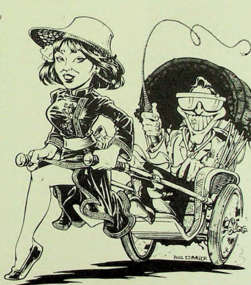
ORDER NOW FROM YOUR U.A. SALESMAN OR EMIRECORDS DISTRIBUTION CENTRE