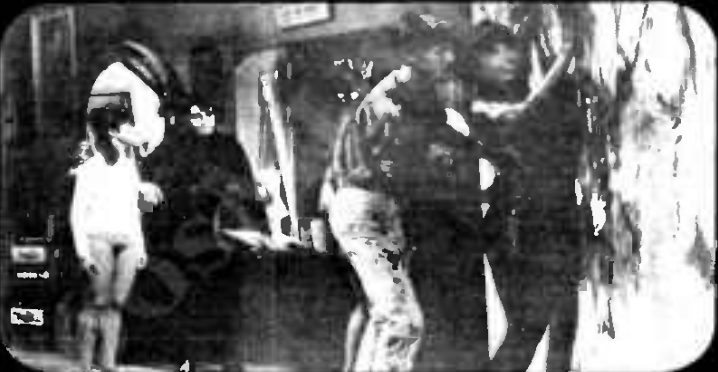
Some kind of kinky action painting going on here—El looks on with interest at his mate smearing paint over a scantily clothed young lody.