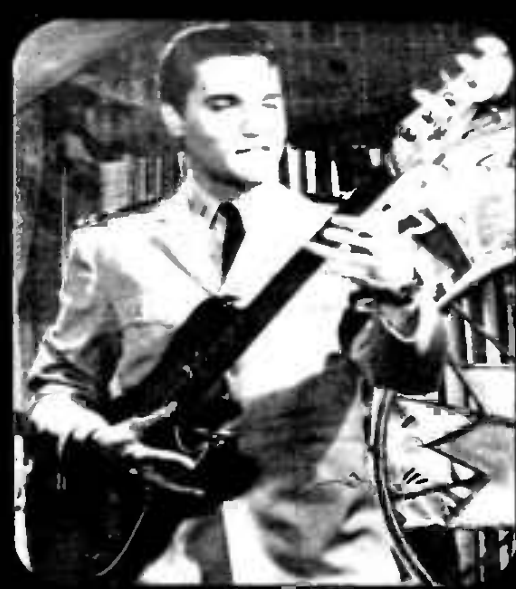
In uniform (not the fashionable type), El bursts into song and guitar playing, It's a bass guitar by the way . . .