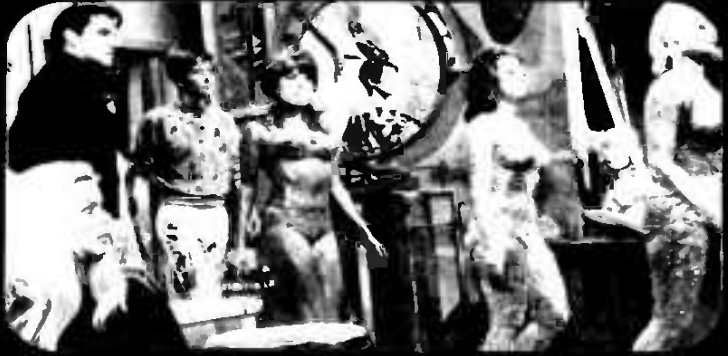
A load more paint-smeared people, mostly female, but with their faces strangely paint and smear-free. Elvis is beginning to look omaxed . . .