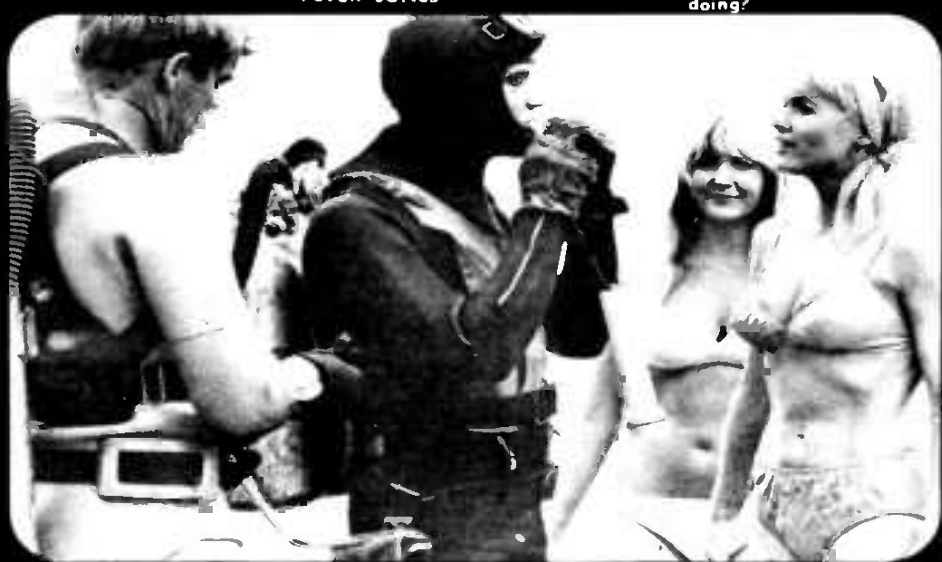
In complete frogmon gear, Elvis chots to a couple of delicious blandes just before he leaps in the water.