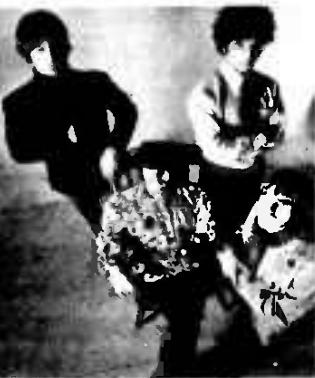
THE BYRDS