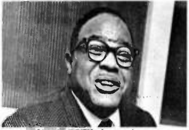
ORY OF HUNTER