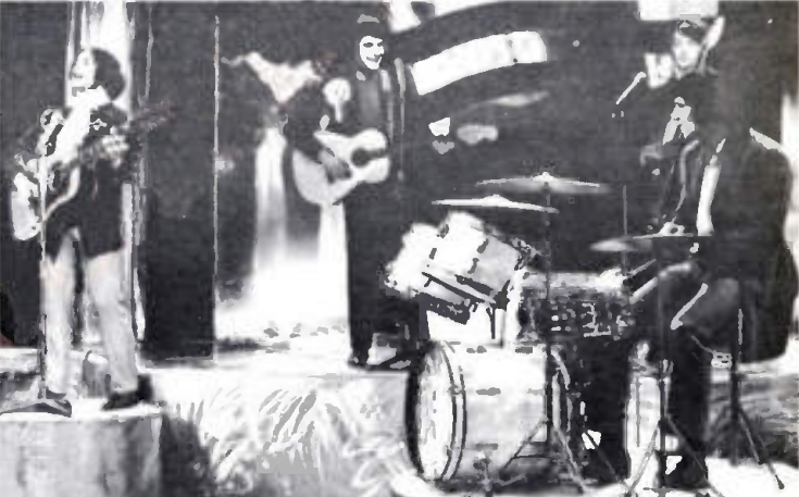
THE KINKS—unusual for a top group to have a "live" album issued

MY view is that whatever Miles has to say is vitally important. Arkue about his intricate pattern, but arcept that he apeals with the ionium of home-iodic, and have been as a set which is overpowerbully staventive, with Miles attaching, then subtily defending, melodic items which can only continuand respect. For me, a disappointment is the vocal frack "Nothink Like You", featuring a rather samely rambling feed to "Pee Wee", which somehow doesn't get in the word doesn't get in the word for the word, despite a last ditch stand but the reat is incredibly gattafying. And one could any "miles above" in inany Davia comeeting