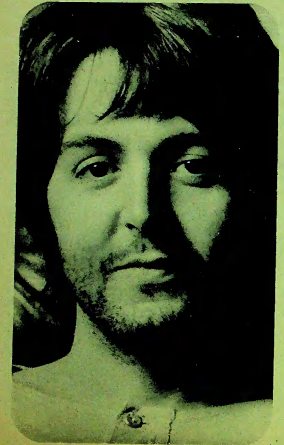
PAUL McCARTNEY: is the Beatles progression reaching a finale? asks a reader

RECORD MIRROR-EVERY THURSDAY -116 SHAFTESBURY W.1. GER 7942/3/4