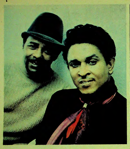
RECORD MIRROR, Week ending May 17, 1969