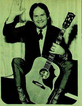
HANK LOCKLIN-his top ten hit here was Me, I'm Falling" Please