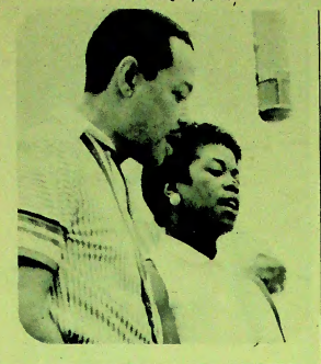
RECORD MIRROR, Week ending May 17, 1969

The true story behind 'Passing Strangers'-the wierdest re-issue of them all . . .